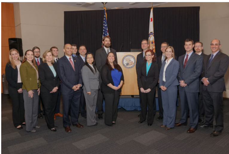
CLIP clinical students and faculty pose with Congressmen Hakeem Jeffries and USPTO officials