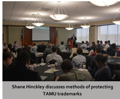
Shane Hinckley discusses methods of protecting TAMU trademarks