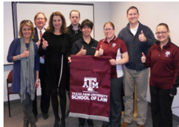
CLIP students and faculty