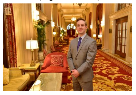
to one of Washington, D.C.'s most storied bars, Old Ebbitt Grille. Check out more photos on the REP-PP website!